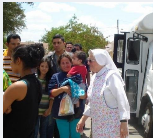
Refugees just arriving in Laredo, TX

From Central America to the Mexico-US border we meet them as they try to find life solutions by which they can help themselves to break the vicious cycle of poverty, abuse, and cruelty in which they are caught.